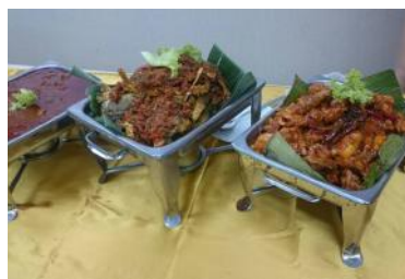
Buffet Warmer (+RM300)