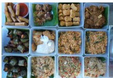
Microwave Container (Free)