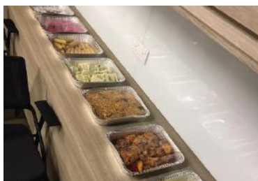
Disposable Tray (Free)