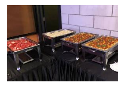
Buffet Warmer (+RM300)