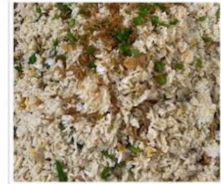
Kampung Fried Rice